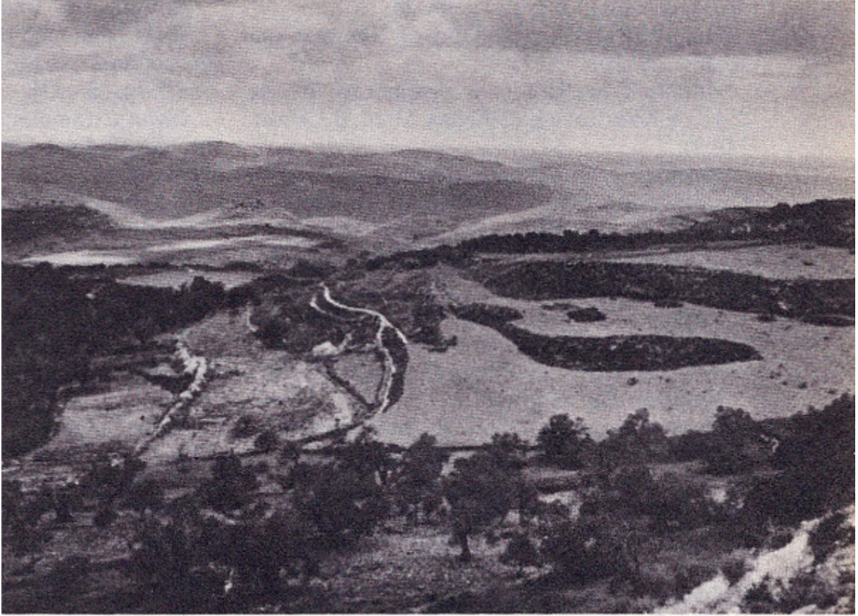
Land of Ephraim. The prophet Hosea predicted that God would punish the tribe of Ephraim, which lived in these fertile hills north of Jerusalem (cf. Hosea 12-13). Hosea said, "Now they sin more and more, and have made them... idols according to their own understanding..." (Hosea 13:2).